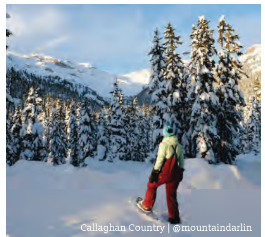
Callaghan Country

Take time to reconnect to yourself and to nature—and bring the ones you love along, too.