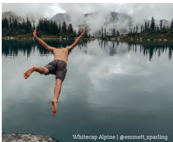
Whitecap Alpine | @emmett_sparling