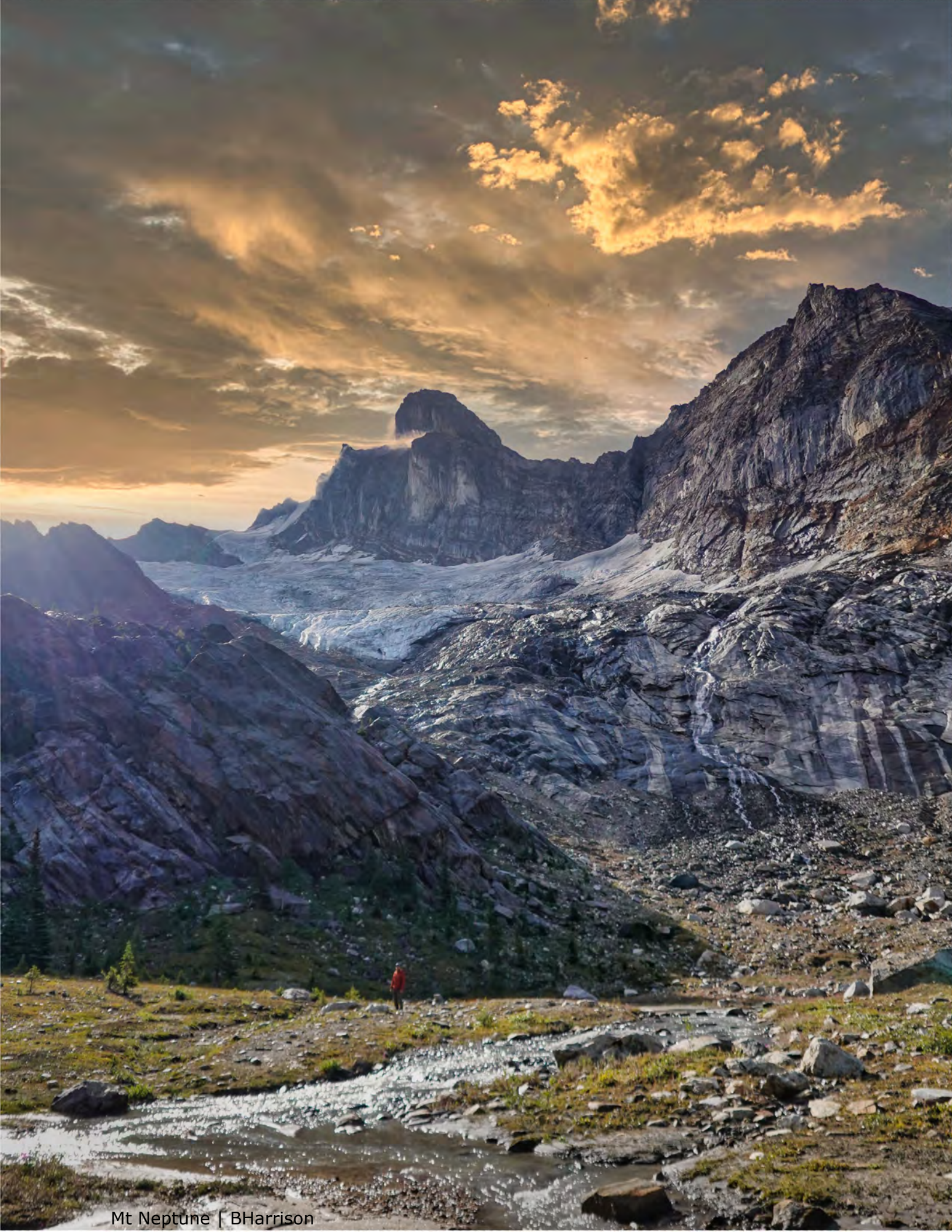
Mt Neptune | BHarrison