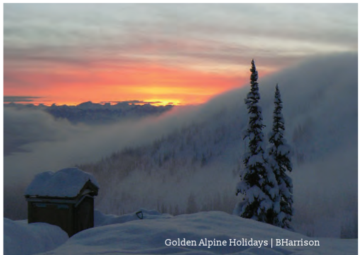
Golden Alpine Holidays | BHarrison