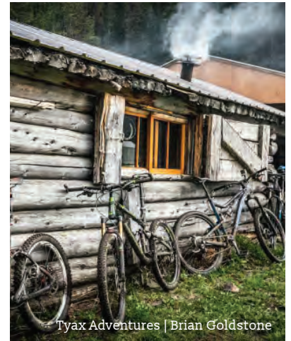
Tyax Adventures | Brian Goldstone