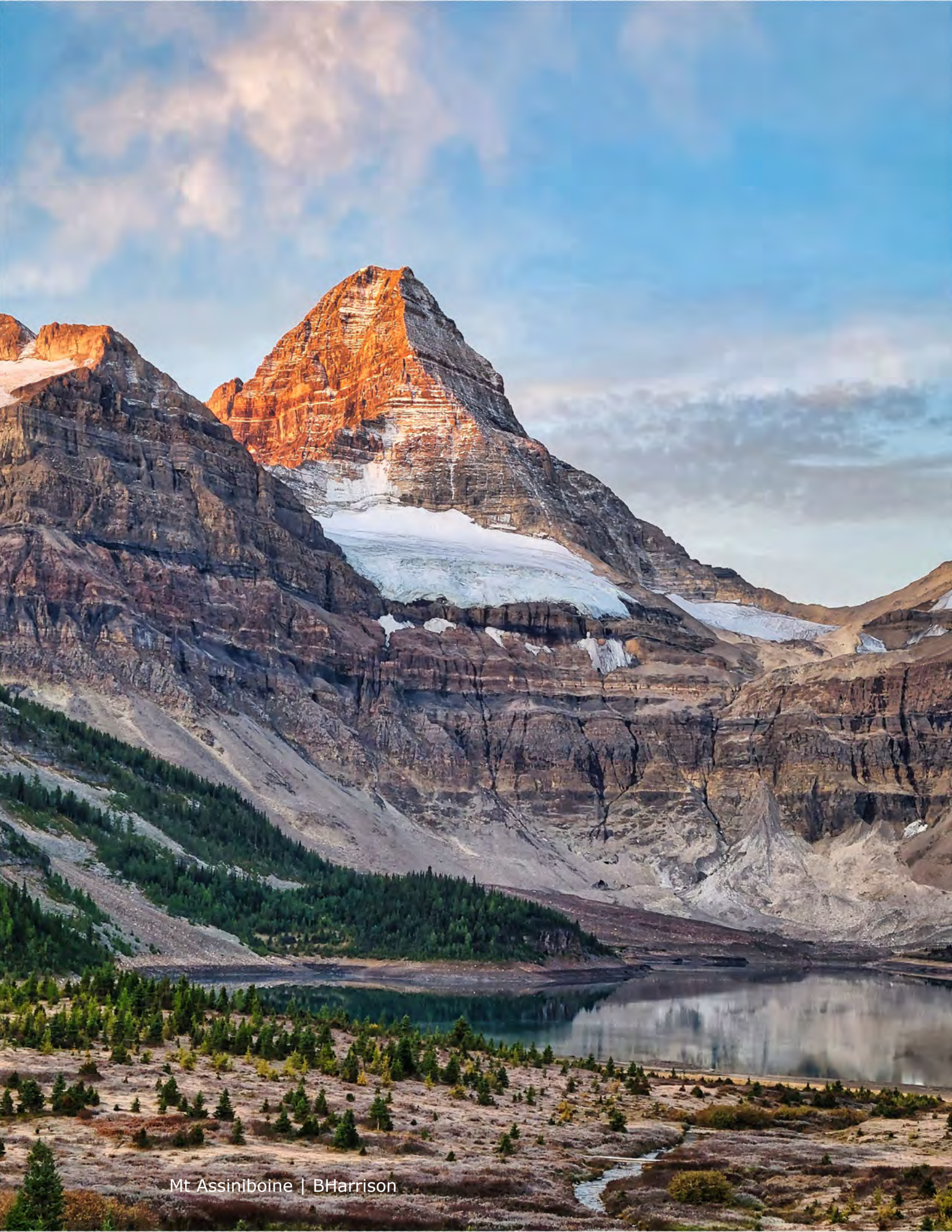
Mt Assiniboine